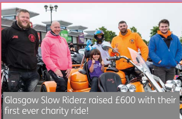
Glasgow Slow Riderz raised £600 with their first ever charity ride!