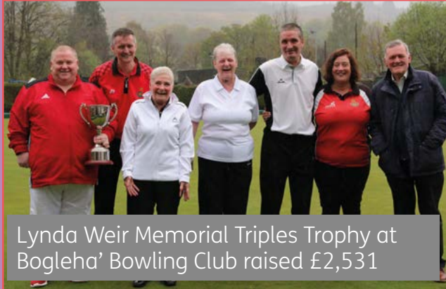
Lynda Weir Memorial Triples Trophy at Bogleha' Bowling Club raised £2,531